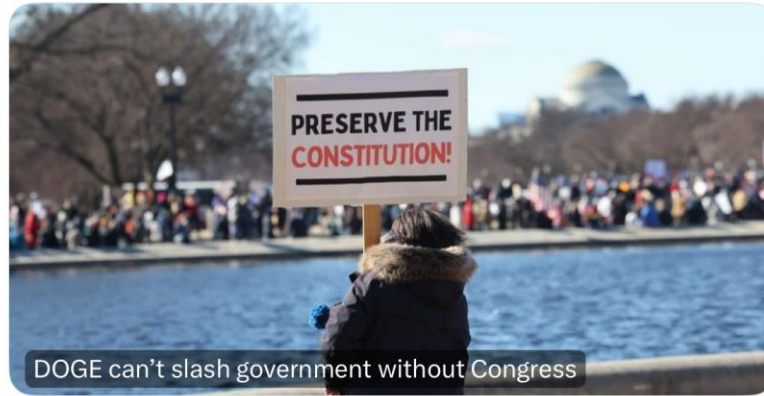
DOGE can't slash government without Congress

Elon Musk's DOGE is tearing through the bureaucracy—but executive action alone won't cut it. Shrinking government requires Congress.